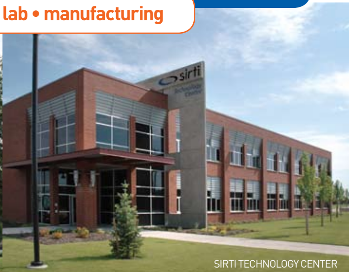
SIRTI TECHNOLOGY CENTER