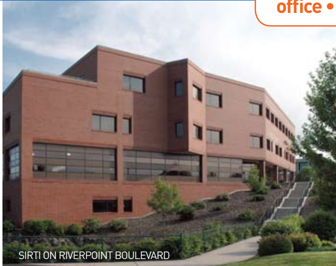
SIRTI ON RIVERPOINT BOULEVARD