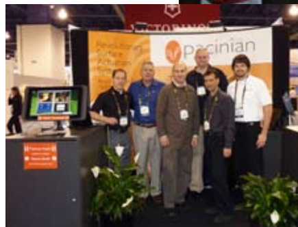
The Pacian team demonstrates new embedded haptic solutions on the CES show floor.

HapticTouch technology continues to receive strong interest from OEM's and touch screen providers from around the world. The firm was able to connect with hundreds of key industry contacts and further develop relationships with Fortune 500 companies at the show.